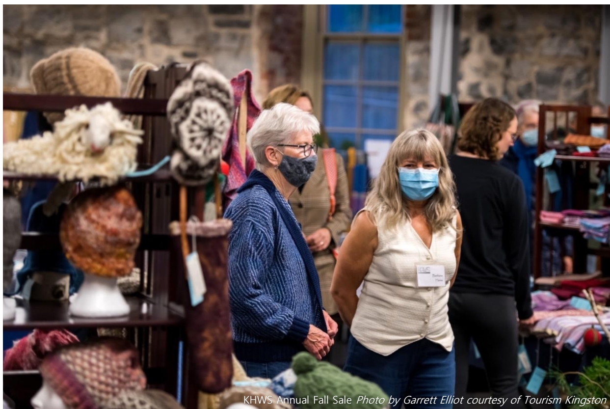
KHWS Annual Fall Sale