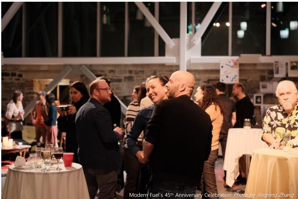
Modern Fuel's 45 th Anniversary Celebration