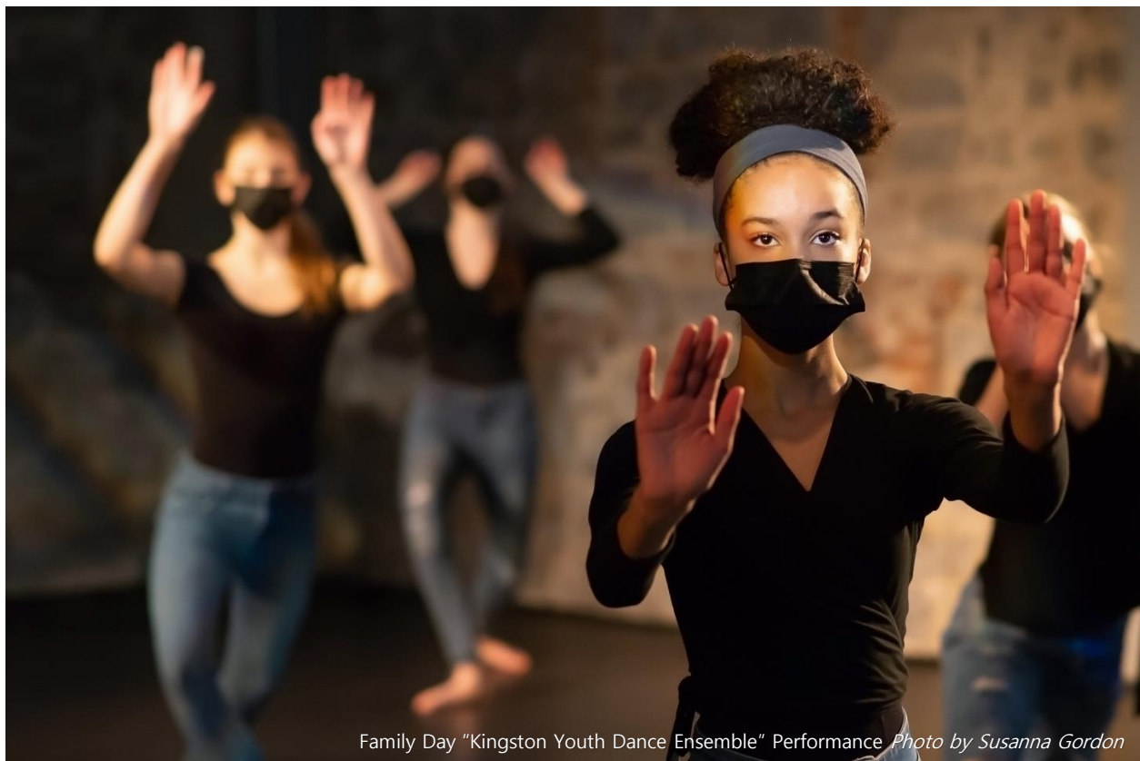
Family Day "Kingston Youth Dance Ensemble" Performance

The Kingston School of Dance (KSD) is proud to be the Greater Kingston Area's only charitable dance organization. Dedicated to enriching the community through dance for over 55 years, it continues to deliver the highest standard of dance education to promote technical, musical, and artistic development for students of all ages, abilities, and backgrounds in a wide variety of dance genres.